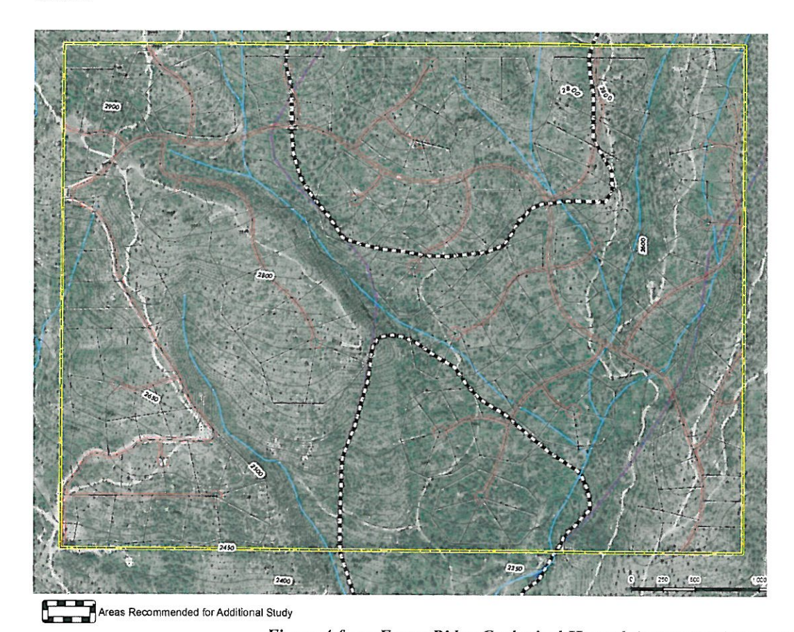
Figure 4 from Forest Ridge Geological Hazard Assessment (August 2010)